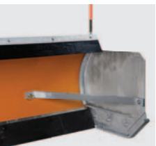
OPTIONAL WING EXTENSIONS